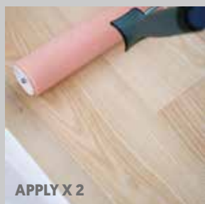
APPLY X 2