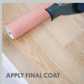
APPLY FINAL COAT