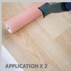
APPLICATION X 2